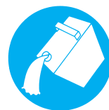
Clean Up Ramuc Thinner or Xylene

Note: All swatch colors shown in this brochure are printed approximations of the actual paint color.