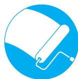
Coverage Up to 450 square feet on recoats