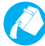
Clean Up Ramuc Thinner or Xylene